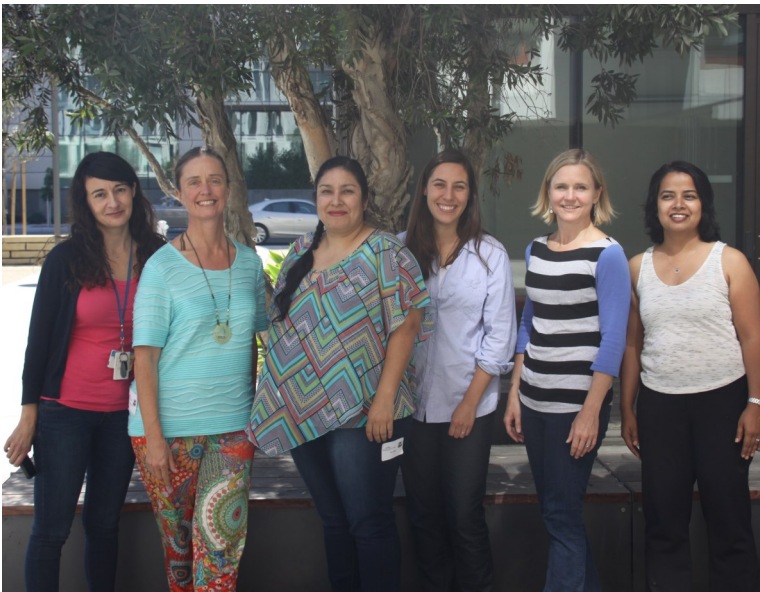
Lead site study team at The University of California San Francisco.

Enrollment is continuing in the “Environmental and genetic risk factors for pediatric MS” study. This research aims to determine environmental and genetic risk factors that make children and adolescents susceptible to developing MS. Funded by the National Institutes of Health (NIH), this study has enrolled 507 children with MS or clinically isolated syndrome (CIS) and 731 children without MS or CIS participating at 17 US pediatric MS centers.